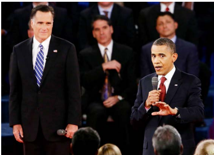
Figure 3. Obama returned to form in the second presidential debate. President Barack Obama and Republican presidential candidate and former Massachusetts Gov. Mitt Romney participate in the second presidential debate at Hofstra University in Hempstead, NY, Tuesday, 16 October 2012.

Here comes the judge. CNN [debate] moderator Candy Crowley ruled for the defense. She didn't need to go to the Rose Garden transcript to confirm the truthfulness of the defendant's side.