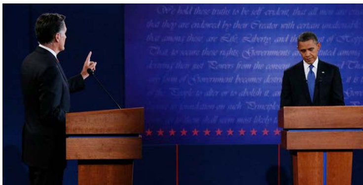
Figure 1. Obama's subdued performance in the 3 October 2012 debate in Denver, CO, endangered his reelection.

Presidential debates are plays within a play. Campaigns are dramas, not fact-finding missions, and debates are theatrical episodes, not academic tests. Everybody knows the televised debates are artificial, scripted, rehearsed, and choreographed. Rhetorical, not deliberative, more professional wrestling than political argument.